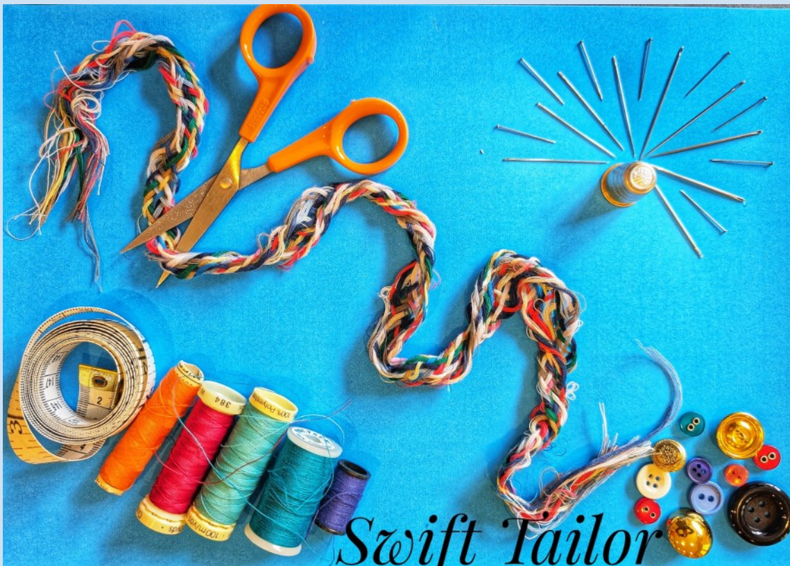
Photograph by Anita