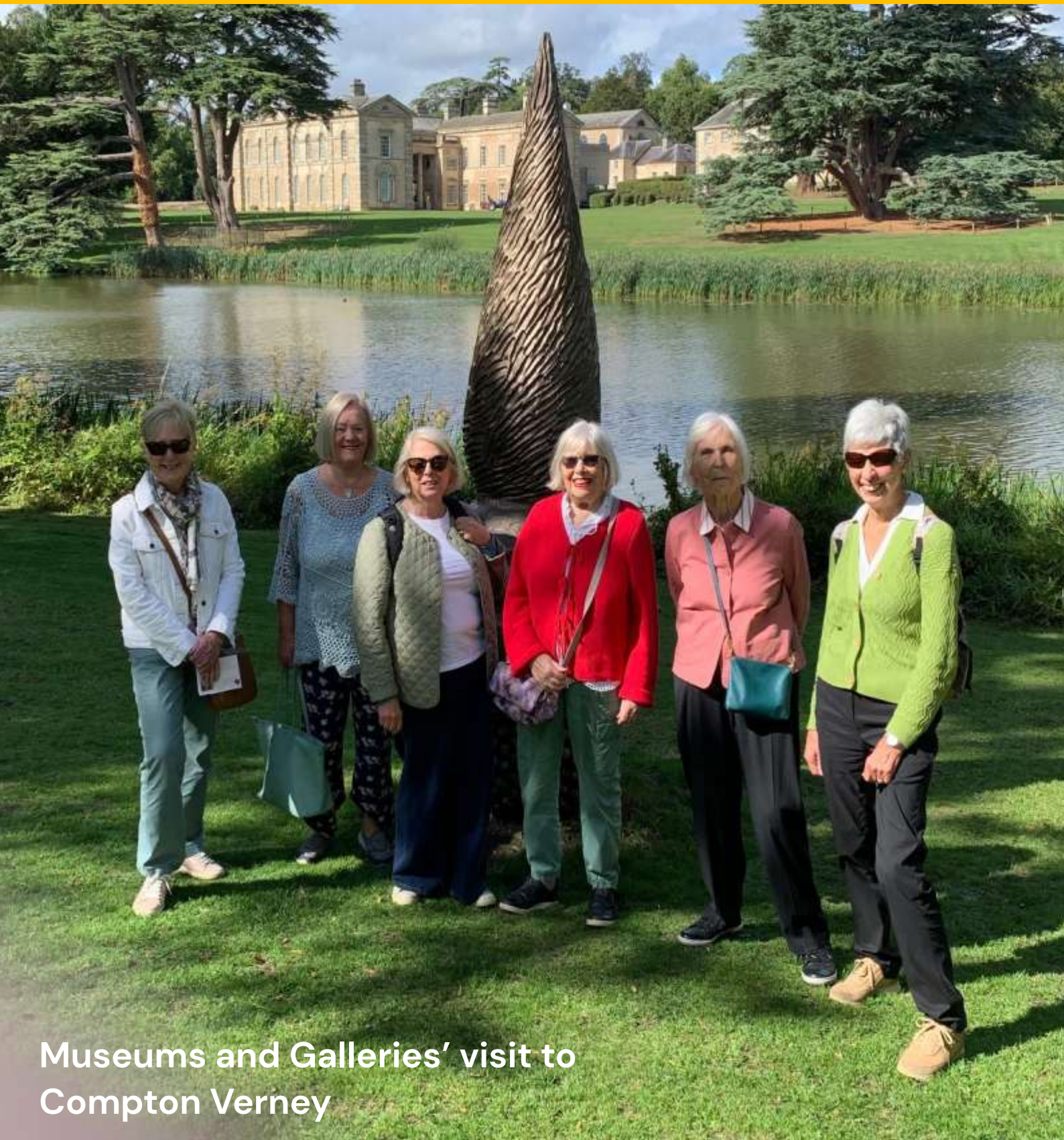
Museums and Galleries' visit to Compton Verney