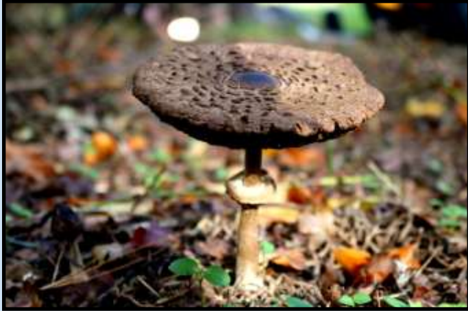
Floating Fungi above the Forest Floor

The Group visited Clumber Park in late October to capture glorious autumnal colours and magnificent fungi. Clumber Park really is at its best at this time of year, and the attached photographs are evidence of this.