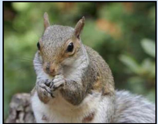
Eating the Autumn bounty! by Eibhlin Dunphy