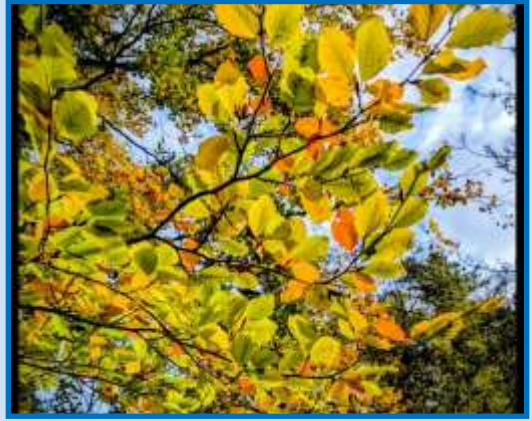
Dappled Colours against the Blue Sky by Anita Allwood