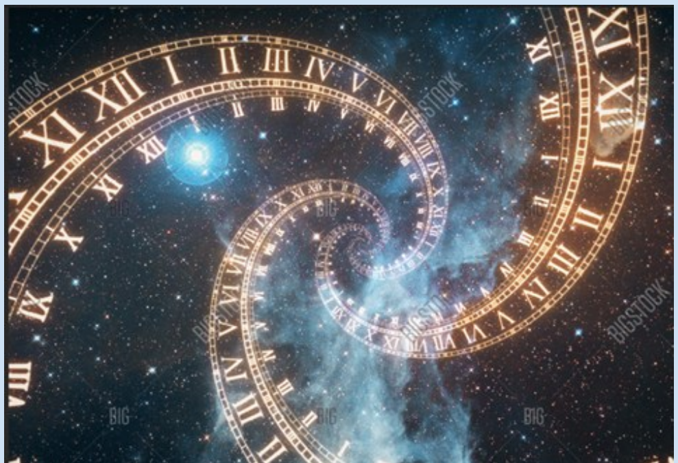
Space Time